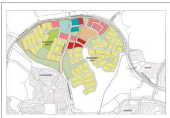
Photo: Moncrieff West Estate development plan

Brown Consulting is currently developing the master plan to determine the layout of the estate, with the estate development plan to be lodged in early 2012.